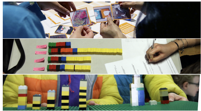
Figure 2: Top: Some participants of “You named it!” activity are comparing data phys cards to assemble design patterns of physicalization (2018). Middle: Visualization made of wooden tiles with Collectif Bam kit during Viskit activity at Super Demain (2016). Bottom: Kids showing visualization made out of LEGO blocks during an activity..

To draw together the reflections and considerations, we followed a three-stage approach. First, after an initial discussion, we each proposed ideas. Using an affinity diagramming technique we started to organise the ideas. Drawing together ideas that were similar. We named them (gave them an indicative phrase) which helped to summarise the concept, and also helped us to refer back to them. Using a live Google document, we each edited and discussed the ideas together. From these we had a list of over twenty five ideas. Second, we had a broad discussion about the ideas, discussed whether