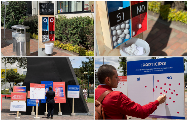
Figure 4: Duarte's Preguntas Sobre el Barrio uses a variety of physical polling visualizations to solicit community input.

“??” for questions). These tweets were then displayed in a vertical list below the input box and in a stacked bar chart, both colored according to the tags they include. The vertical axis of the visualization corresponded to a time window, and bar heights showed the number of tweets emitted at that particular time slot. Unlike The Death of a Terrorist , Polemic Tweet 's input mechanisms is not spatially overlaid with the visualization. However, the two are tightly integrated and all data visualized in the Polemic Tweet interface was generated in that immediate context.