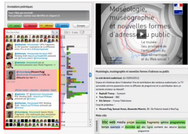
Figure 3: Polemic Tweet centers around a stacked bar chart (center) which visualizes the labels entered as participants comment.

To our knowledge, the only information visualization model to describe data input via visualizations is Jansen and Dragicevic's interaction model for visualizations beyond the desktop [17]. Their model differentiates concrete rendering pipelines (in which existing