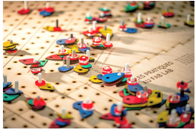
Figure 5: The Cairn tabletop records information about projects created in a shared makerspace using composable physical tokens.

These four cases studies, as well as the examples highlighted in figure 1, showcase a diversity of physical and digital input visualization approaches—including both straightforward examples and ones that challenge visualization norms, as well as the boundaries of our own definition of input visualizations.