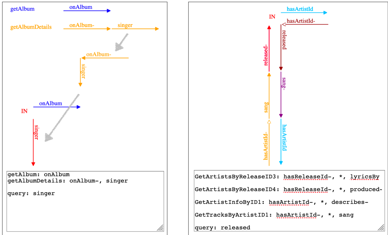
Figure 2: Screenshots of our demo. Left: Our toy example, with the functions on top and the plan being constructed below. The gray arrows indicate the animation. Right: A plan generated for real Web service functions. In both cases, the bottom box contains the function definitions and the query.

shape, but we do not have functions that would allow us to construct a plan of this shape. In order to find those sequences of relations that correspond to execution plans, we need the language of all possible execution plans. In its simplest variant, this language is just the iterated disjunction of the bodies of the functions. In our running example, the language is given by the following regular expression E :