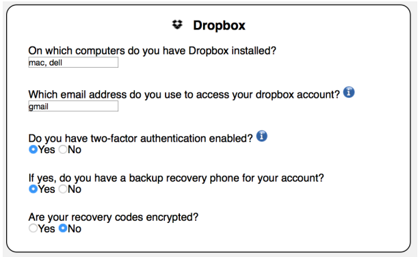
Figure 2: Screenshot of the questionnaire

combinations K \subset \mathcal{K} , and see if we can derive x-data from \mathcal{K} \setminus K . If we can, then x is safe at level |K|.