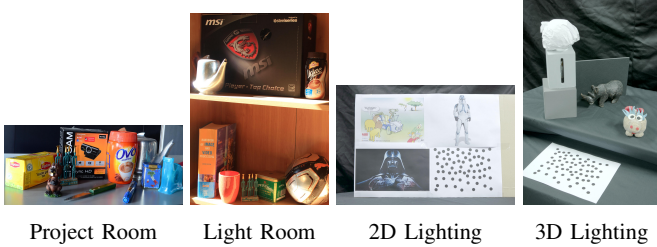
Fig. 1: Example images from the datasets employed in this work.

descriptor. The SIFT descriptor is a 128-dimensional histogram formed by concatenation of the image gradients computed on 4x4 grid spatial neighborhood around the detected keypoint.