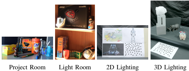
Fig. 1: Example images from the datasets employed in this work.

descriptor. The SIFT descriptor is a 128-dimensional histogram formed by concatenation of the image gradients computed on 4x4 grid spatial neighborhood around the detected keypoint.