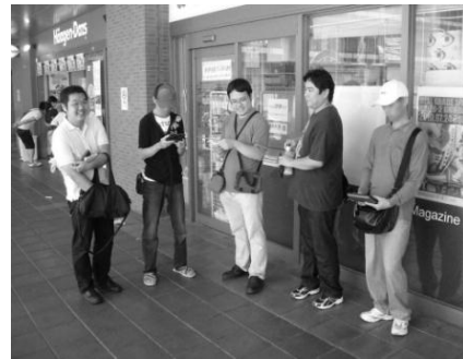
Figure 3. The start of the meeting at Shizuoka station, with the core group of regulars.

The meetings at Shizuoka station particularly highlight this Japanese orientation towards articulating game and mobility practices. The ‘organizer’ usually announces meetings on the three forums mentioned above, and any player is free to join. Those who regularly participate in such gatherings are often able to recognize one another by sight and to identify each other by their game handles and/or forum aliases, when the two differ. However, they do not usually exchange their real names or mobile phone numbers, maintaining a relatively tight boundary between game-related sites of communication and their other activities as individuals.