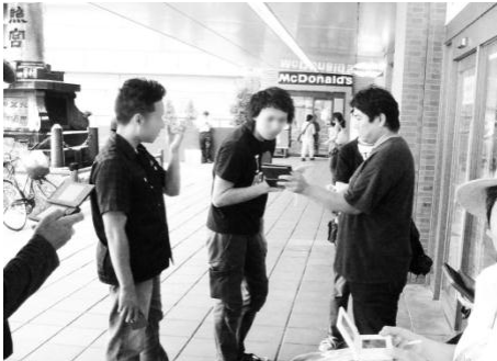
Figure 4. A newcomer 'bravely' addressing the organizer and joining in to exchange maps

channels of interaction at least (e.g. co-presence and the game itself) have been opened and somewhat aligned, since the physical appearance of the player who has manifested his presence can now be linked to his game handle. On the basis of his physical appearance, he has become recognizable for future co-present encounters as the owner of a particular character, even if his 'real' name remains unknown. When the co-presence of players is managed thus, the incoming person makes his 'visit' a shared encounter between players and the event is accomplished as a seamless whole.