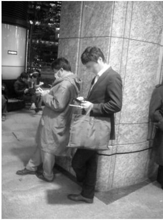
Figure 2. A player with the game terminal in his right hand and his mobile phone in the other

The mobile internet communication infrastructure introduces new seams in the surechigai tsushin situation, and the possibility of even more fragmented and multi-layered participation frames.