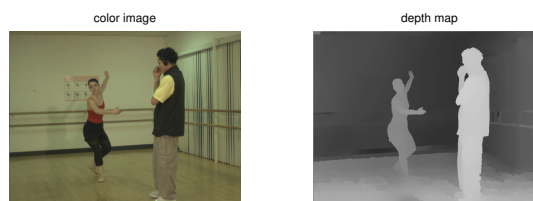
Fig. 1. At each instant the output of each Z-camera is the color image and the corresponding 8-bit depth map

Two very important issues in MVD are coding and transmission. In this work we focus only on the first one, which is usually faced by coding separately the color video and the depth data by a simulcast coding structure (where each view is coded independently) or a multiview-coding structure (where the views are jointly coded) [4]. For example Ho and Oh [5] share the motion information between the texture and the depth. They proposed to code the texture video